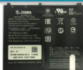
BTRY-ET5X-8IN5-01 8 in. Tablet Internal Battery