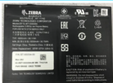
BTRY-ET5X-10IN5-01 10 in. Tablet Internal Battery