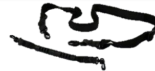
SG-ET5X-SHDRSTP-01 Break away Shoulder Strap