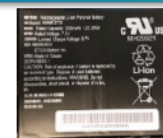
BTRY-ET5X-8IN3-01 8 in. Tablet Internal Battery