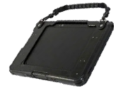
SG-ET5X-HNDSTP-01 Handle strap