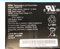
BTRY-ET5X-10IN3-01 10 in. Tablet Internal Battery